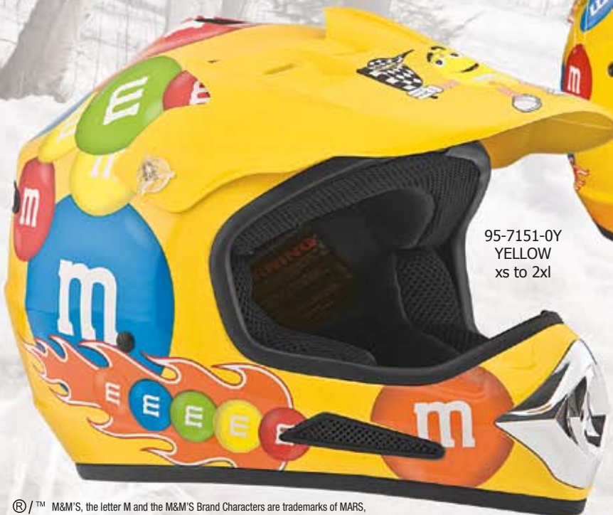
95-7151-0Y YELLOW xs to 2xl