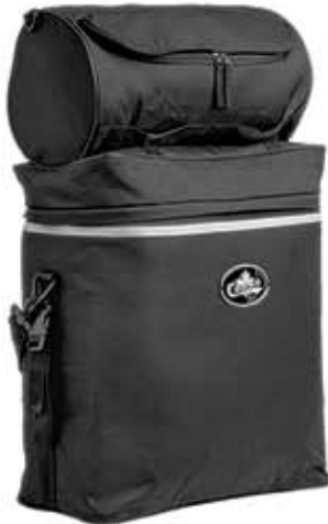
DELUXE REAR CARRIER BACK-PACK BAG 95-0530-00