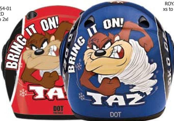
95-7254-02 ROYAL xs to 2xl