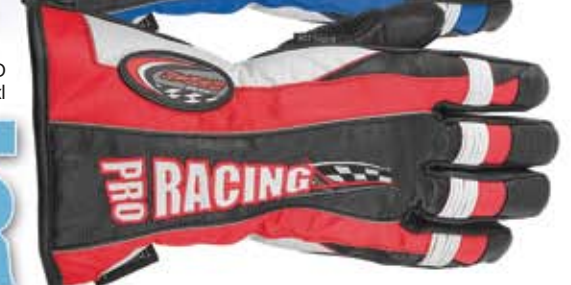
-01 RED s to 2xl