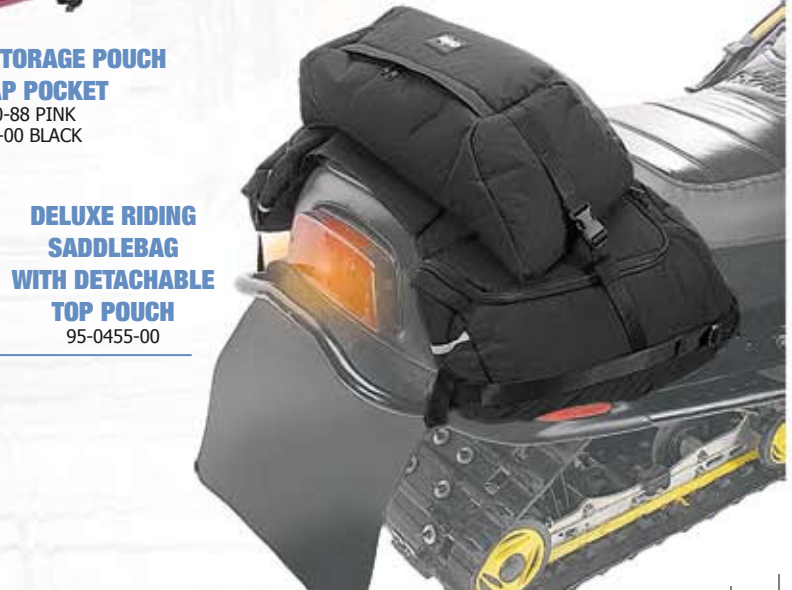
DELUXE RIDING SADDLEBAG WITH DETACHABLE TOP POUCH 95-0455-00