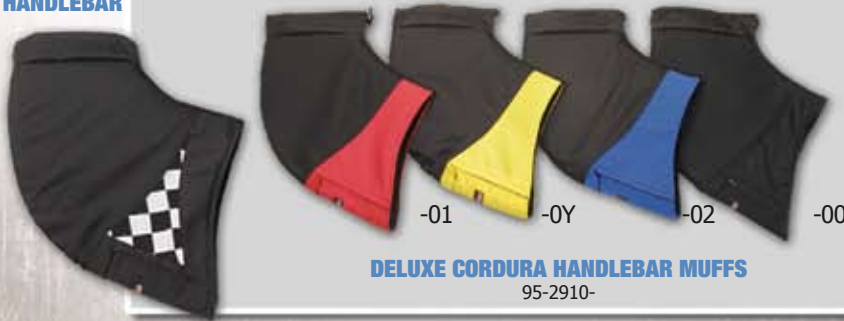
DELUXE CORDURA HANDLEBAR MUFFS 95-2910-