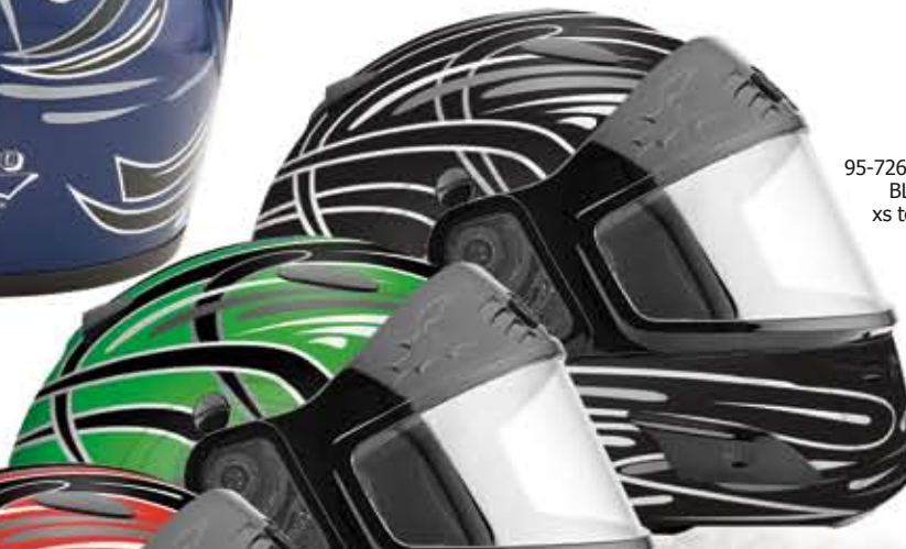
95-7260-00 BLACK xs to 2xl

DELUXE MODULAR HELMETS COME QUICK TINT LENS & MULTI-FIT CHEEK PADS