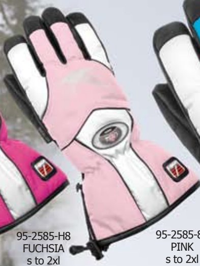
95-2585-80 PINK s to 2xl