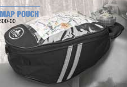
TANK BAG/MAP POUCH 95-0300-00