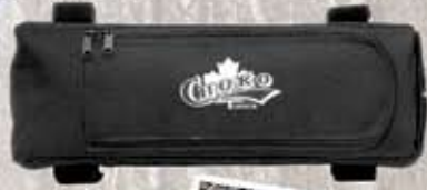
CLUTCH COVER BAG 95-0750-00