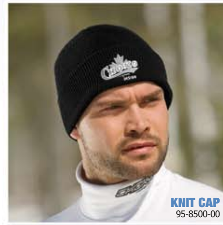
KNIT CAP 95-8500-00