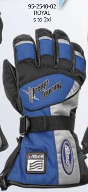
95-2540-02 ROYAL s to 2xl