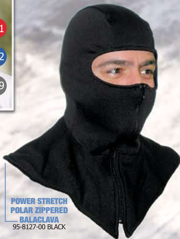
POWER STRETCH POLAR ZIPPERED BALACLAVA