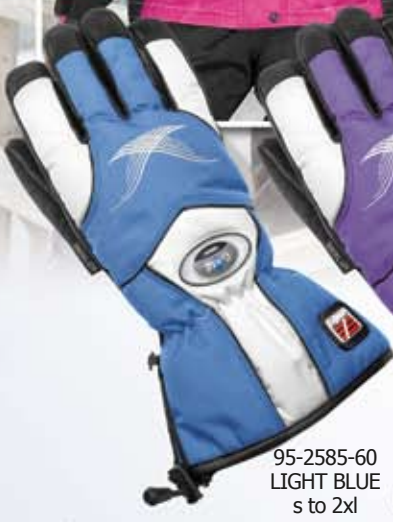
95-2585-60 LIGHT BLUE s to 2xl