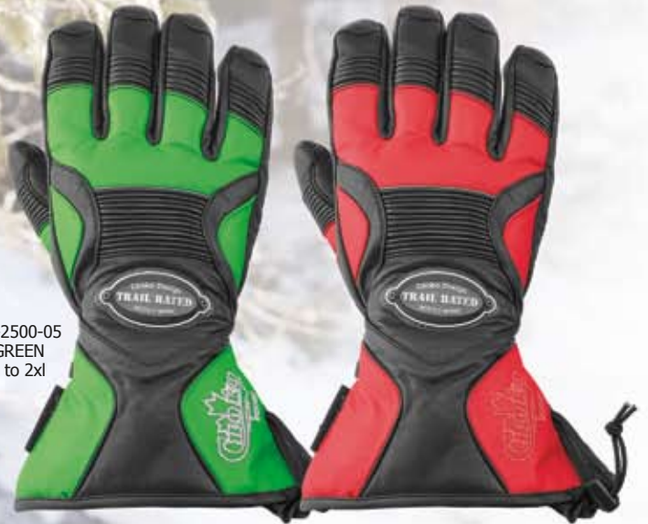
95-2500-05 GREEN s to 2xl