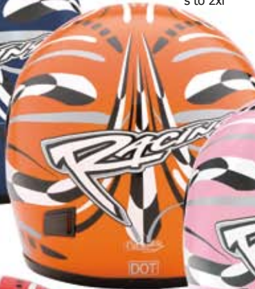
95-7350-OR ORANGE s to 2xl