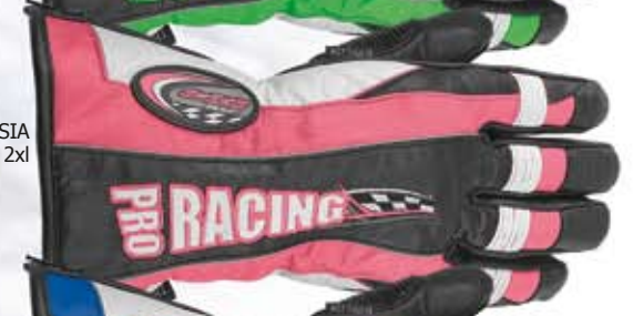
-H8 FUCHSIA xs to 2xl