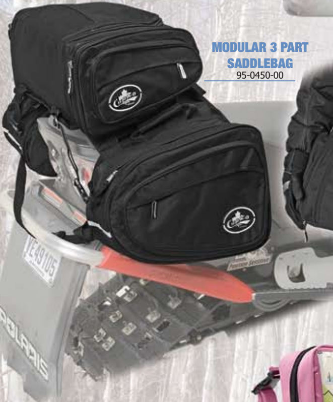
MODULAR 3 PART SADDLEBAG 95-0450-00