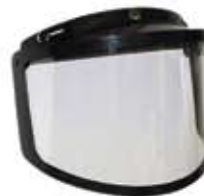
DOUBLE LENS ANTI-FOG FLIP SNOW SHIELD snaps on 47-7520PSH BLACK