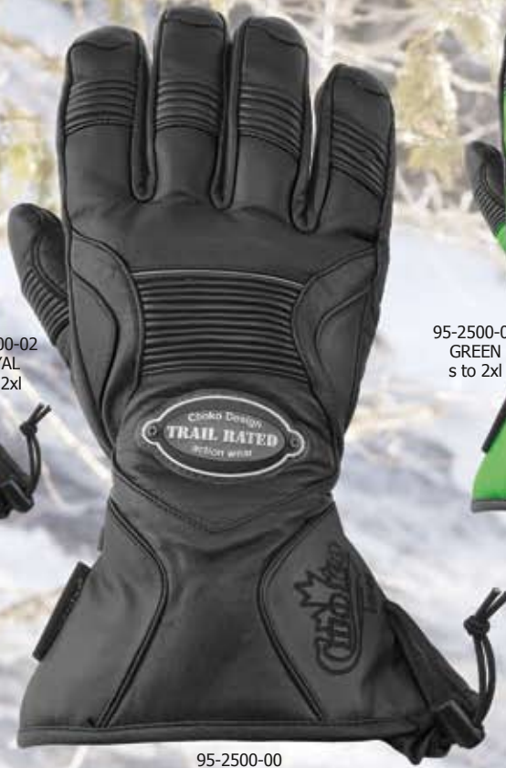
95-2500-00 BLACK xs to 2xl