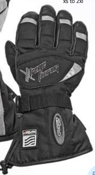
95-2540-00 BLACK xs to 2xl