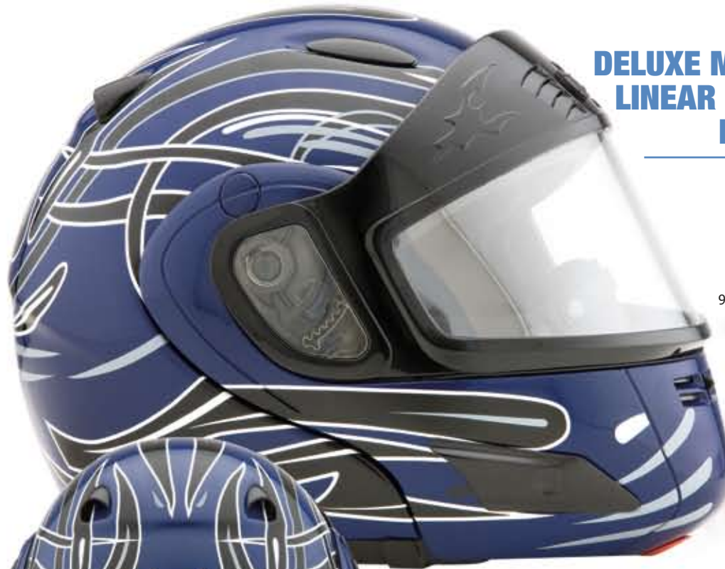
95-7260-20 ROYAL s to 2xl