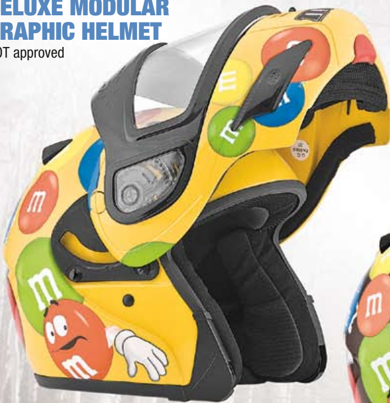
95-7251-0Y YELLOW xs to 2xl