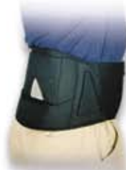
NEOPRENE BACKSUPPORT 95-4200-00 BLACK xs to xl LIGHTWEIGHT BACK SUPPORT 95-4220-00 BLACK xs to 2xl