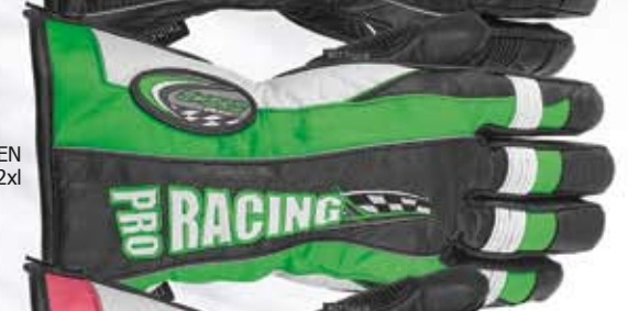
-05 GREEN s to 2xl