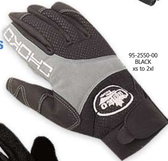
95-2550-00 BLACK xs to 2xl