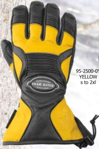
95-2500-0Y YELLOW s to 2xl