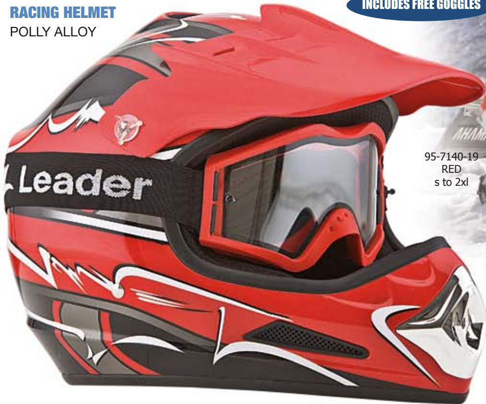
95-7140-19 RED s to 2xl

Poly alloy snowcross DOT approved 95-7110-00 BLACK xs to 2xl