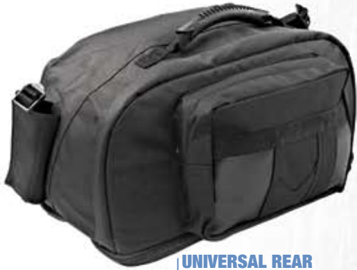
UNIVERSAL REAR RACK BAG 95-0565-00