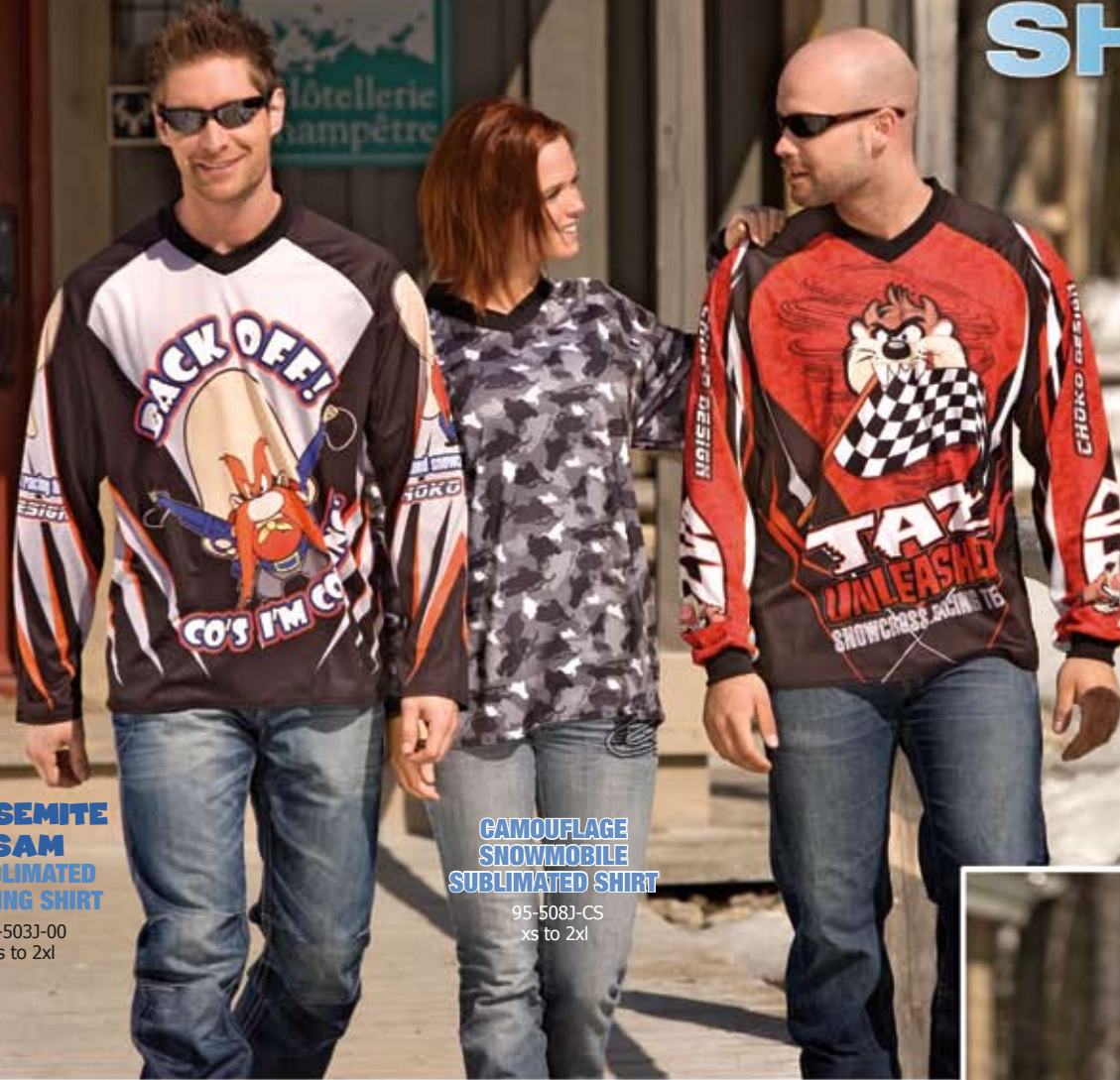
YOSEMITE SAM SUBLIMATED RACING SHIRT