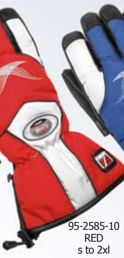
95-2585-10 RED s to 2xl