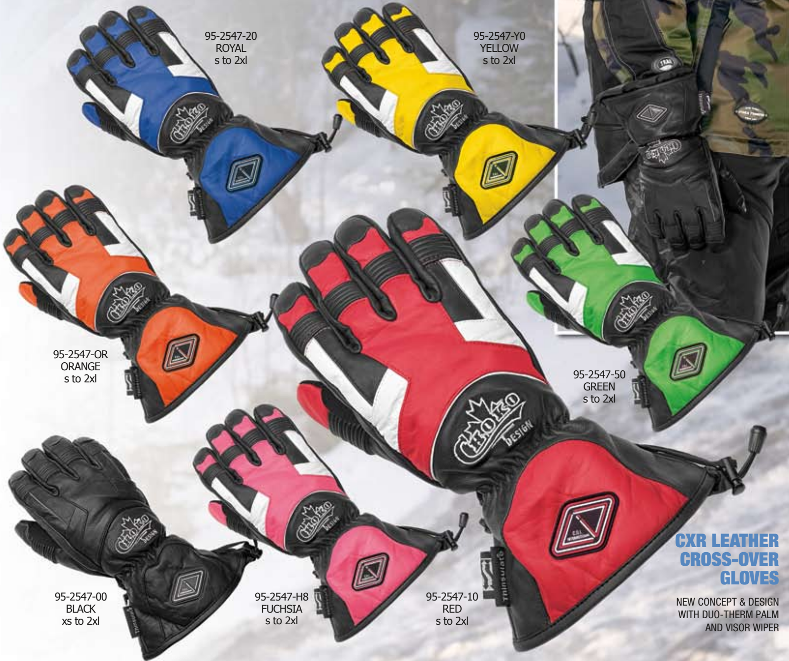
95-2547-20 ROYAL s to 2xl