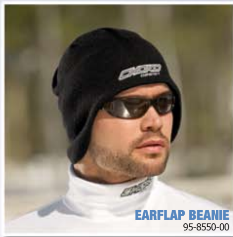
EARFLAP BEANIE 95-8550-00