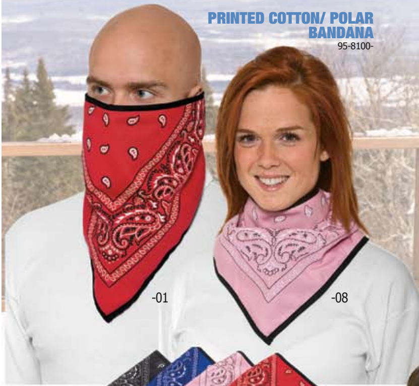
PRINTED COTTON/ POLAR BANDANA 95-8100-