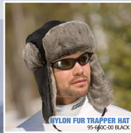
NYLON FUR TRAPPER HAT 95-660C-00 BLACK