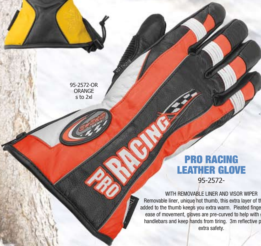
95-2572-OR ORANGE s to 2xl