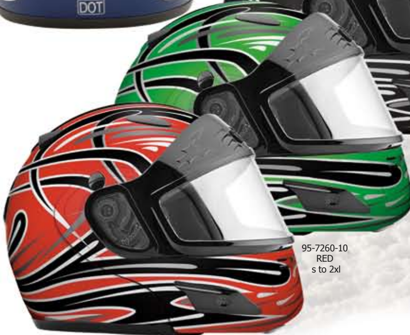
95-7260-50 GREEN s to 2xl