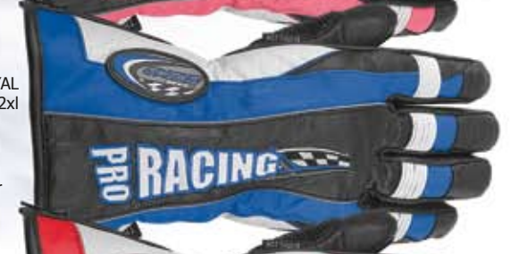
-02 ROYAL s to 2xl