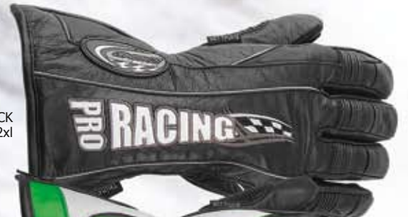
-00 BLACK xs to 2xl