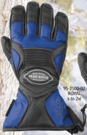
95-2500-02 ROYAL s to 2xl