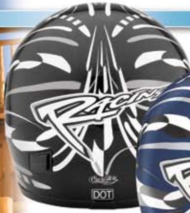
95-7350-00 BLACK xs to 2xl