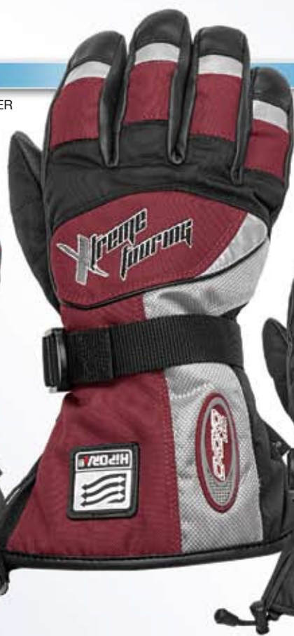
95-2540-BR BURGUNDY s to 2xl