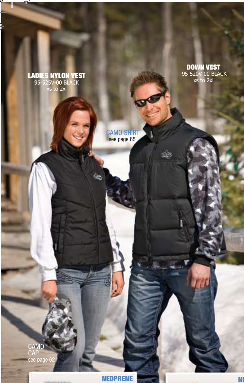
LADIES NYLON VEST 95-525V-00 BLACK xs to 2xl