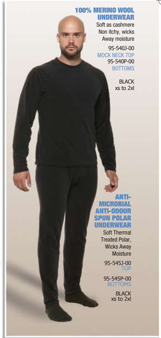
100% MERINO WOOL UNDERWEAR Soft as cashmere Non itchy, wicks Away moisture 95-540J-00 MOCK NECK TOP 95-540P-00 BOTTOMS