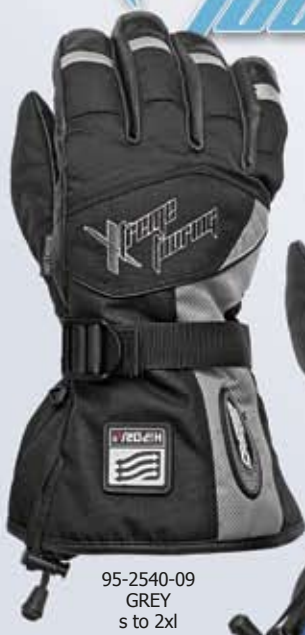
95-2540-09 GREY s to 2xl

MEN'S GLOVE - nylon/cordura with VISOR WIPER