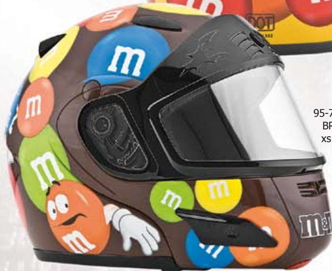
95-7251-BR BROWN xs to 2xl