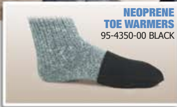
NEOPRENE TOE WARMERS 95-4350-00 BLACK