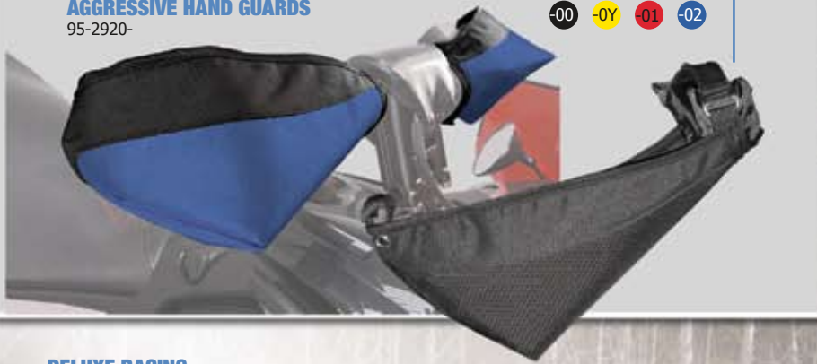
DELUXE INSULATED AGGRESSIVE HAND GUARDS 95-2920-