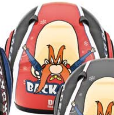
95-7253-01 RED - xs to 2xl