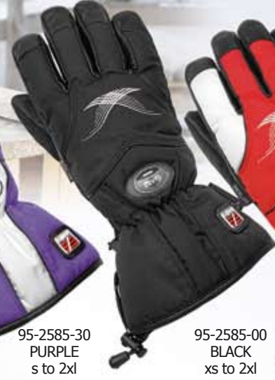
95-2585-00 BLACK xs to 2xl