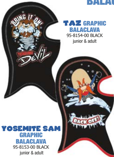
TAZ GRAPHIC BALACLAVA