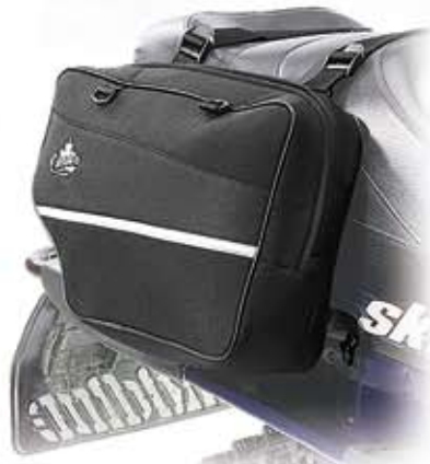
SADDLEBAG/WEBBING SEAT BANDS 95-0400-00