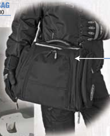
detachable top trunk