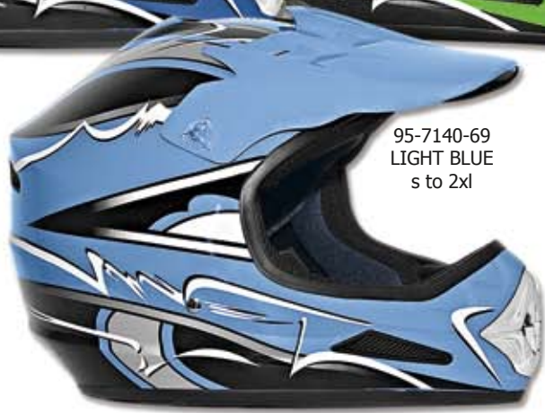
95-7140-69 LIGHT BLUE s to 2xl