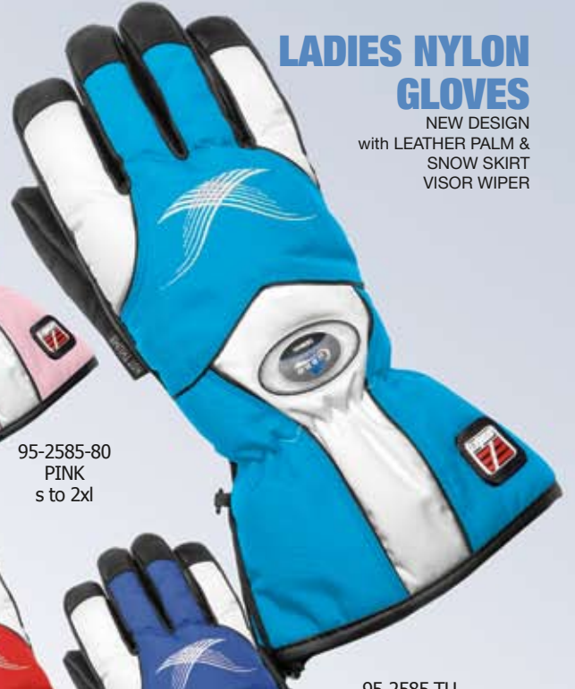
95-2585-TU TURQUOISE s to 2xl