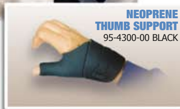
NEOPRENE THUMB SUPPORT 95-4300-00 BLACK