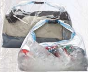
VINYL BAG LINER 95-0920-00