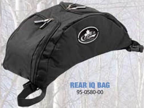
REAR IQ BAG 95-0580-00

They are designed for easy installation and fit most snowmobiles.