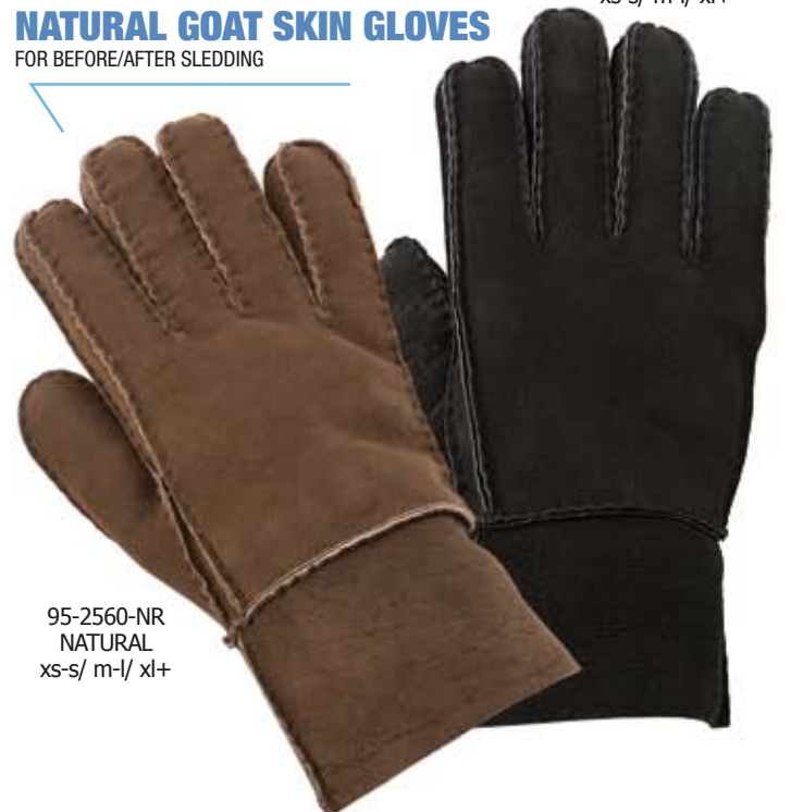
95-2560-NR NATURAL xs-s/ m-l/ xl+