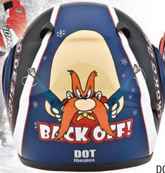
95-7253-02 ROYAL - xs to 2xl

Comes with quick tint lens, and multi-fit cheek pads.