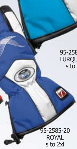
95-2585-20 ROYAL s to 2xl