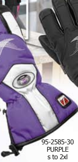
95-2585-30 PURPLE s to 2xl