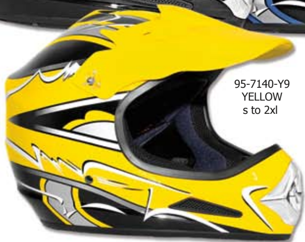
95-7140-Y9 YELLOW s to 2xl