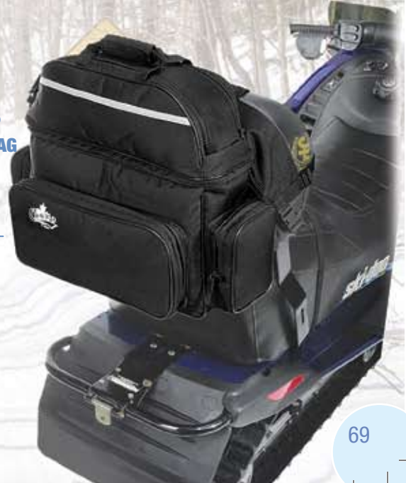
DELUXE 2-UP BACKREST BAG WITH BEVERAGE HOLDER 95-0515-00