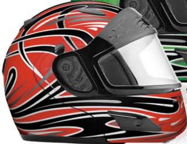
95-7260-10 RED s to 2xl