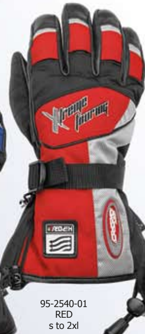
95-2540-01 RED s to 2xl