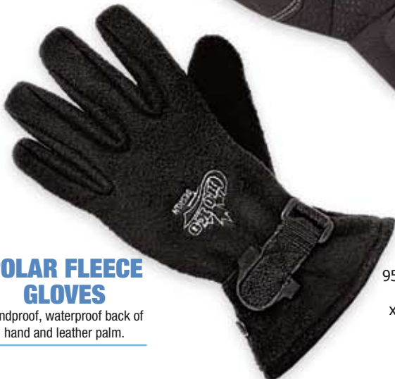
95-2590-00 BLACK xxs to 2xl

Windproof, waterproof back of hand and leather palm.