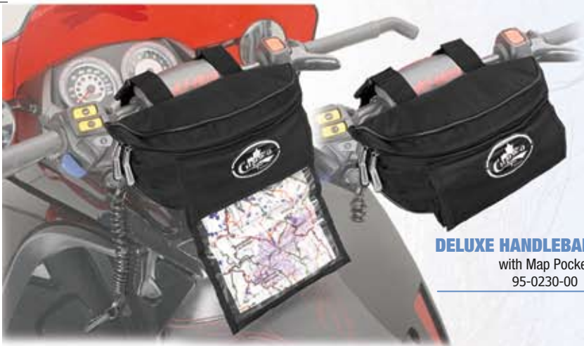
DELUXE HANDLEBAR POUCH with Map Pocket 95-0230-00