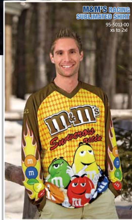
M&M'S RACING SUBLIMATED SHIRT