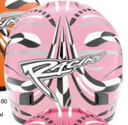
95-7350-80 PINK xs to 2xl