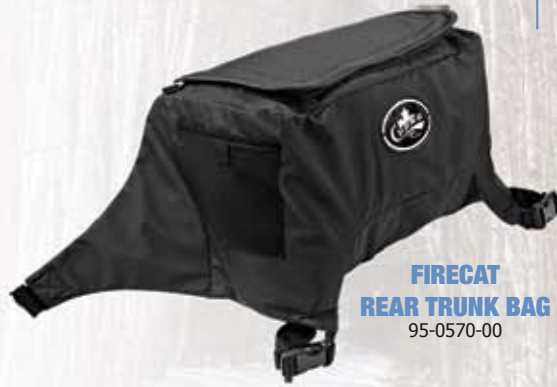
FIRECAT REAR TRUNK BAG 95-0570-00