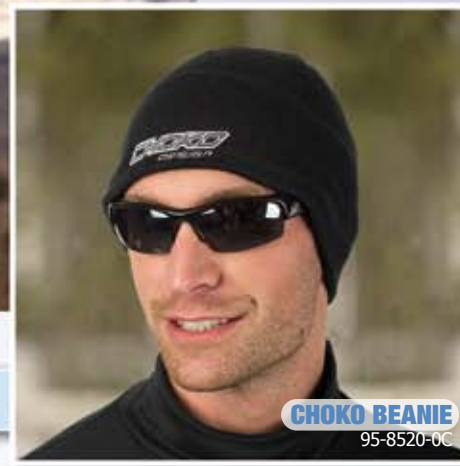
CHOKO BEANIE 95-8520-00