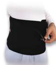
PADED KIDNEY BELT 95-4250-00 BLACK s to xl