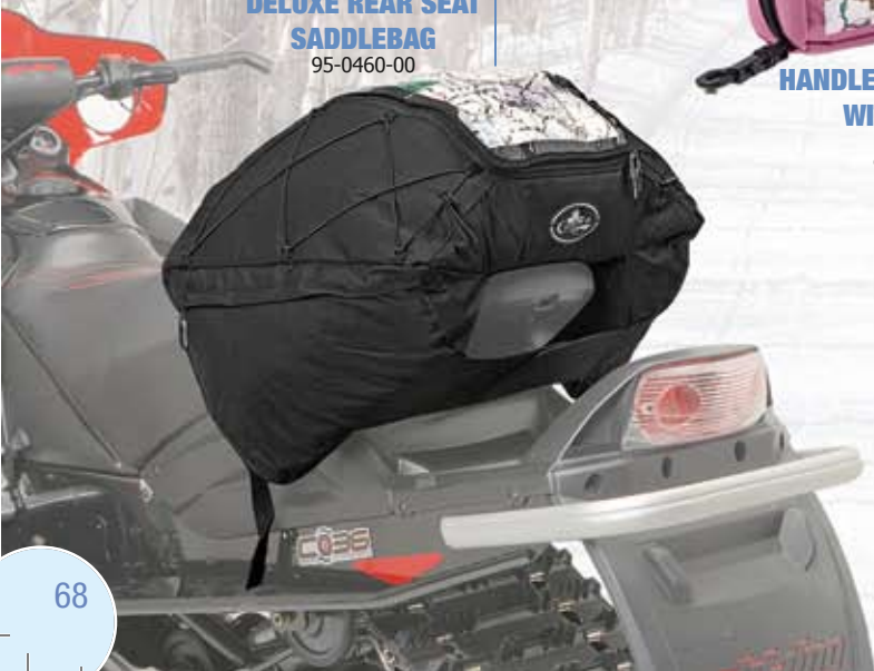
DELUXE REAR SEAT SADDLEBAG 95-0460-00