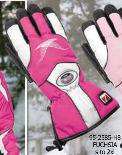
95-2585-H8 FUCHSIA s to 2xl