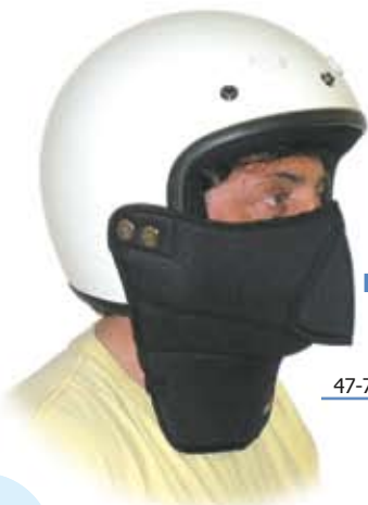
FOAM FACE PROTECTOR / BREATH DEFLECTOR with velcro 47-7586-00 BLACK