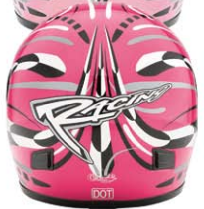
95-7350-H8 FUCHSIA xs to 2xl