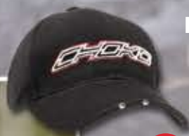
PANTHER VISION LED LIGHTED CHOKO CAP