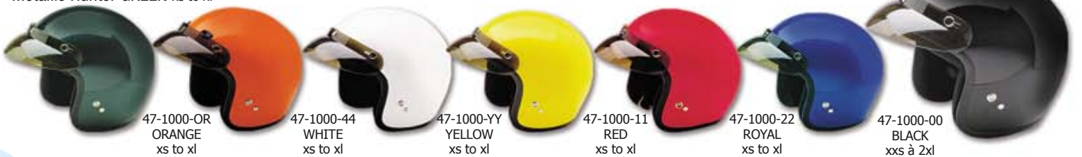
47-1000-OR ORANGE xs to xl