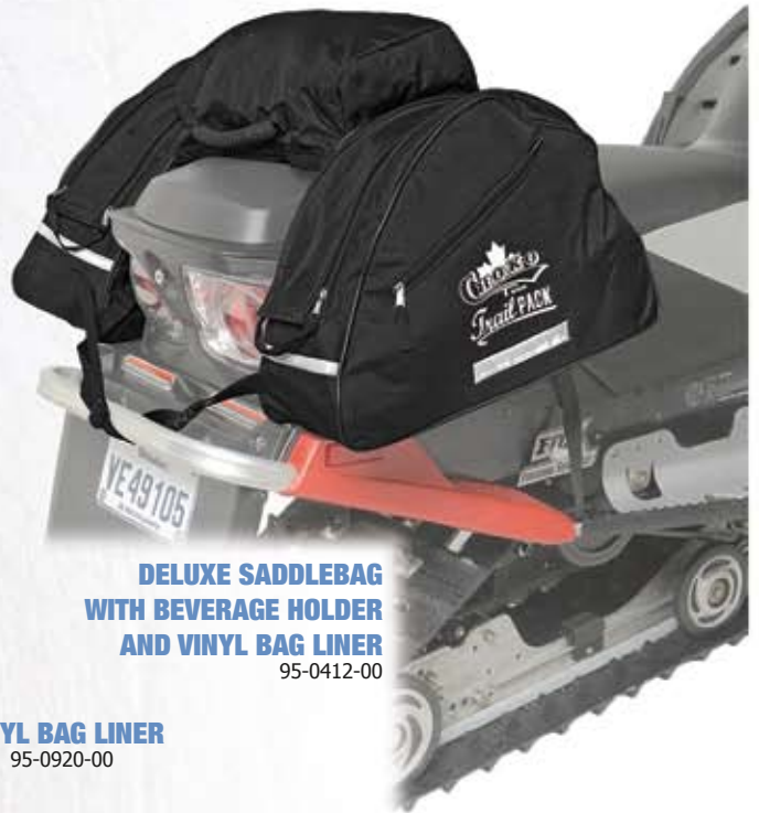
DELUXE SADDLEBAG WITH BEVERAGE HOLDER AND VINYL BAG LINER 95-0412-00