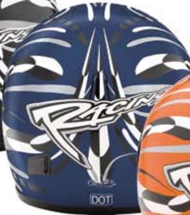
95-7350-20 ROYAL s to 2xl