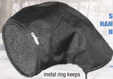
SNOWMOBILE HANDLEBAR MUFFS NEW EASY-IN OPENING 95-2900-00 BLACK

metal ring keeps the shape of the opening