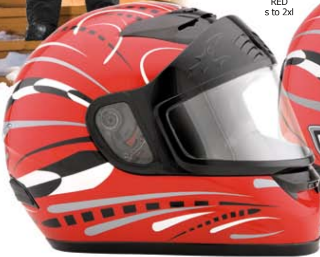
95-7350-10 RED s to 2xl