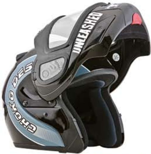
95-7254-01 RED xs to 2xl

LOONEY TUNES and all related characters and elements are trademarks of and © Warner Bros. Entertainment Inc. (s09)