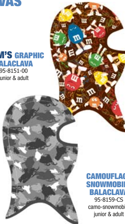
CAMOUFLAGE SNOWMOBILE BALACLAVA

95-8159-CS camo-snowmobile junior & adult