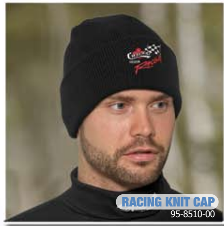
RACING KNIT CAP 95-8510-00