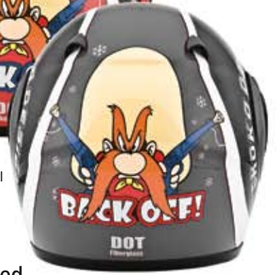
95-7253-00 BLACK - xs to 2xl