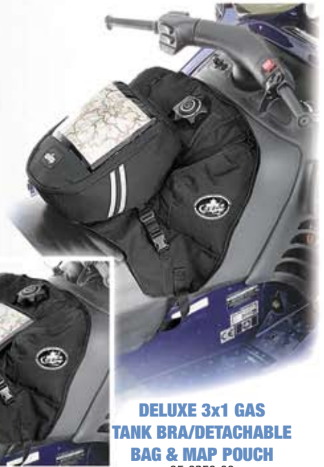
DELUXE 3x1 GAS TANK BRA/DETACHABLE BAG & MAP POUCH 95-0350-00