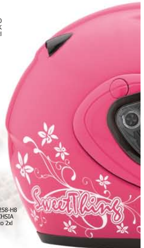
95-7258-H8 FUCHSIA xs to 2xl