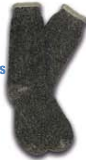
EXTREME BEAR S WOL SOCKS 95-552S-00 BLACK Jr. 7/9 Md 9/11 Lg 10/13