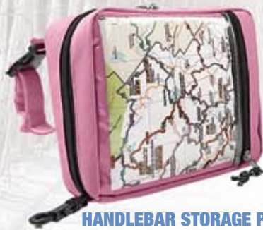
HANDLEBAR STORAGE POUCH WITH MAP POCKET 95-0240-88 PINK 95-0240-00 BLACK