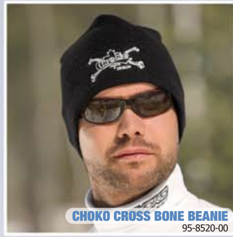
CHOKO CROSS BONE BEANIE 95-8520-00